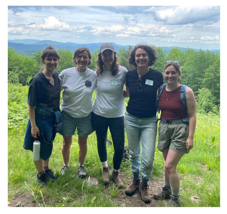
Patterson Mountain Hike